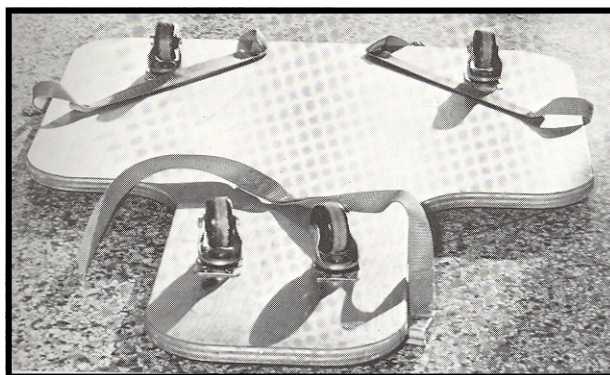
Underside of Scoot-A-Bout, showing attachment of straps and casters.